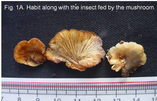
Fig. 1A. Habit along with the insect fed by the mushroom.

Basidiocarp plane pruinose. Pileus 2–2.5 cm dia., dry, convex to plane, greyish orange when moist, olive brown (4E6) on drying, with reddish brown (8E8) disc, smooth; margin undulating, smooth. Lamellae decurrent, cream yellow (6E4), edge brown entire, crowded with lamellulæ of six lengths, sometimes bifurcating. Stipe absent (Fig. 1A).